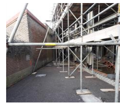
BIRDCAGE SCAFFOLDING USED TO PROVIDE SAFE ACCESS WHEN INSTALLING ROOF JOISTS